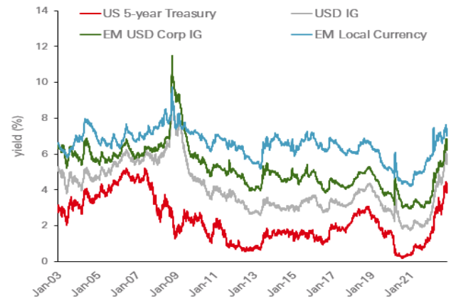
Chart 2: Global bond yields stay at historically high levels, almost back to the pre-2008 highs

Past performance is not a reliable indicator of future performance.