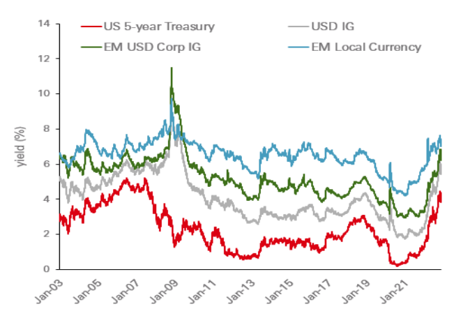
Chart 2: Global bond yields stay at historically high levels, almost back to the pre-2008 highs

Past performance is not a reliable indicator of future performance.