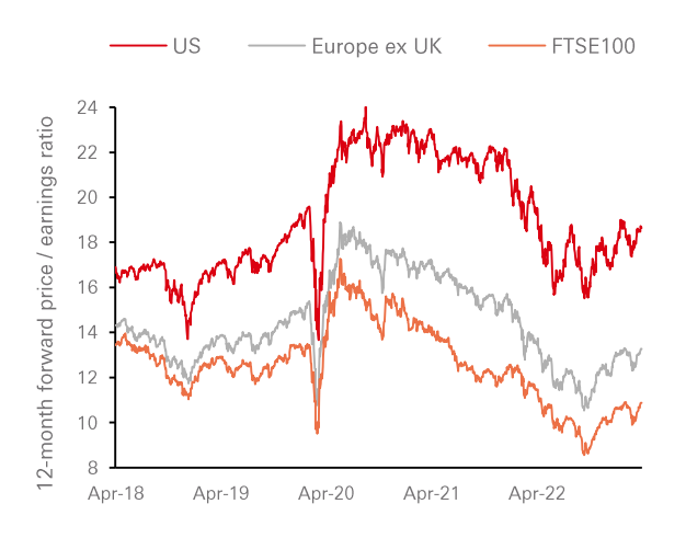
Chart 2: UK stocks are cheap vs Eurozone and US stocks

Past performance is not a reliable indicator of future performance.