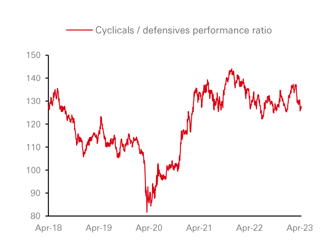
Chart 3: Cyclicals are trading near the cheaper end of the 3-year range compared to defensives

Past performance is not a reliable indicator of future performance.