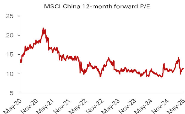
Chart 3: Valuations of Chinese stocks are near 5-year lows

Past performance is not a reliable indicator of future performance.